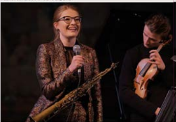
Jess Gillam and her Ensemble played the opening night concert at Proms at St Jude's Saturday.

The opening weekend of The Proms at St Jude's saw live concerts and book talks in Hampstead Garden Suburb.