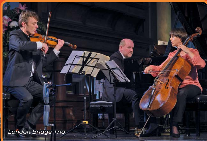
London Bridge Trio