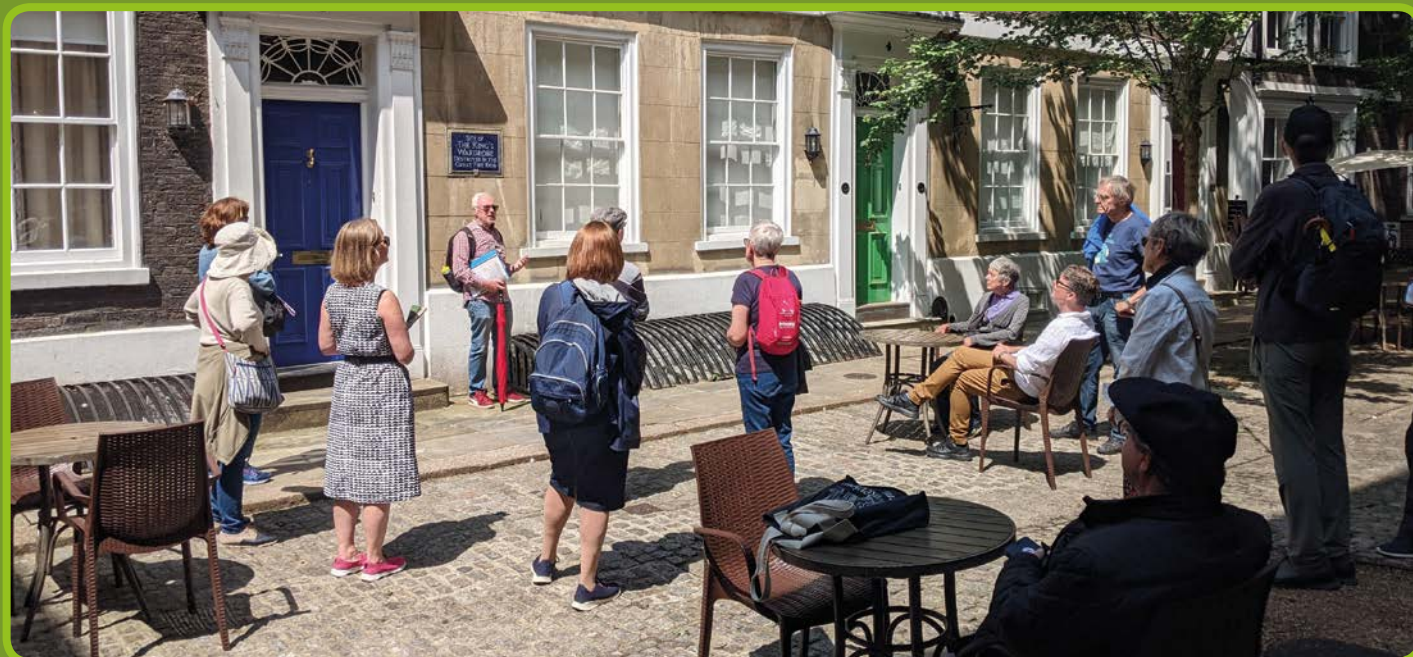
Shakespeare's London walk